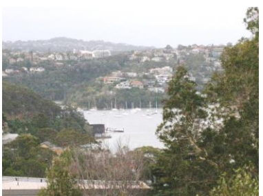
Balcony Aspect 2