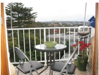
Balcony Aspect 1