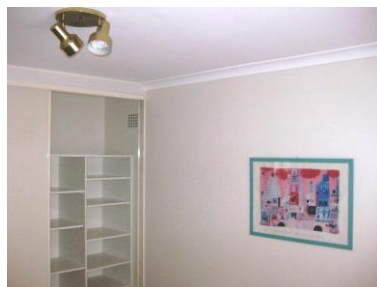
Room for Rent – Aspect 2