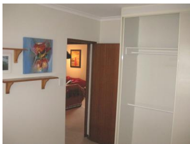
Room for Rent – Aspect 1

Unfurnished room with large built-in wardrobe, in quiet, second floor, 2 bed unit, 39 Stanton Rd Mosman. Close to bus, shops and walk to lovely Balmoral Beach. Spacious lounge & dining area, internal laundry & bath. Shared sunny balcony with partial water views. Includes internet Wi-Fi, Unlimited calls to national landlines & Fetch TV. ALDI has specials on bedroom furniture if you need. To share with interesting 58yr male, refs available from AOL. Prefer mature, spiritually aware lady. $230/wk plus share electricity.